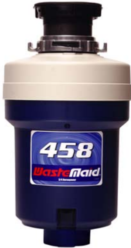
3/4 HP DELUXE