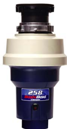
1/2 HP MID DUTY